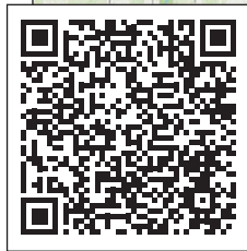
Fish and Wildlife Map